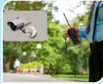
CCTV SURVEILLANCE & SECURITY