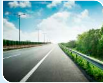
WIDE BLACK TOP ROADS (33, 30FEET)