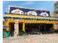
Adyar Ananda Bhavan