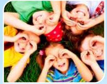
SAFE ENVIRONMENT FOR CHILDREN