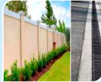
SECURED COMPOUND WALL & DRAINAGE SYSTEMS