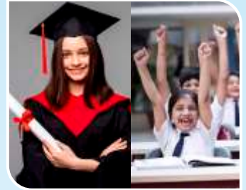
NEAR BY SCHOOLS & COLLEGES