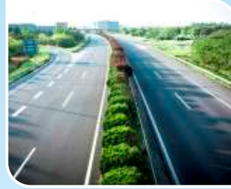
COIMBATORE TO SALEM HIGHWAYS